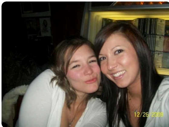
so happy i got to grow up with you as my best friend, our trip to hawaii, the trouble we caused...