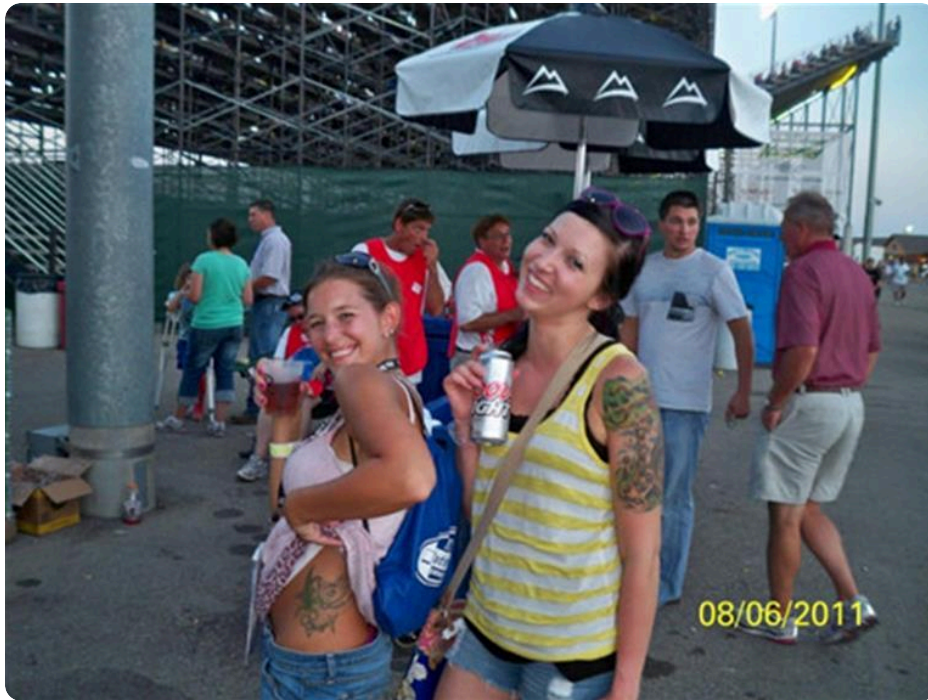
so happy i got to grow up with you as my best friend, our trip to hawaii, the trouble we caused...