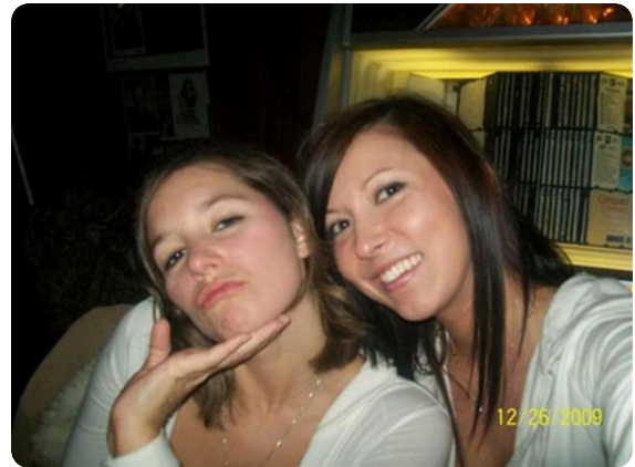
so happy i got to grow up with you as my best friend, our trip to hawaii, the trouble we caused...