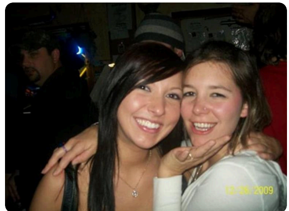
so happy i got to grow up with you as my best friend, our trip to hawaii, the trouble we caused...